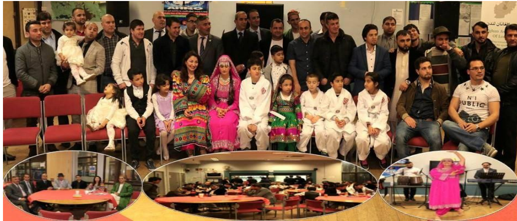
Figure 1: Celebrating the ancient Nowruz- which means New Day in Farsi/Dari -marks the start of Spring